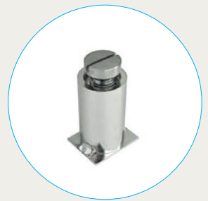
Anchor W/SCREW as fixing accessories.