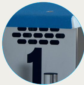
Opening for electronic timing speaker.